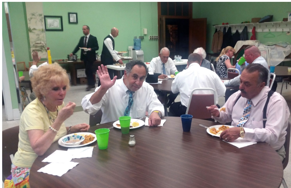
The Back to Work Dinner on September 13, 2018

Benjamin Franklin, Grand Master of Pennsylvania, 1790